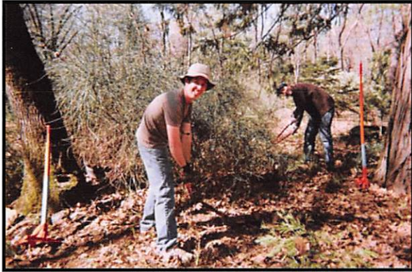
Volunteers at work

Broom Education and Eradication Program (BEEP) is a Forest Ranch community action group formed in December, 2006 for the purpose of controlling broom infestations in the community. Forest Ranch is a foothills community and therefore concerned about fire danger. Since broom increases the threat of fire, removal is a high priority. BEEP has become an affiliate of the Big Chico Creek Watershed Alliance .