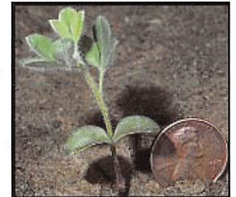
French Broom Seedling

Seedlings: Seedlings will appear after the winter rains. These can be pulled by hand or sprayed carefully with glyphosate (e.g.: Roundup™). Since broom seed banks are long-lived, plan on being vigilant for several years.