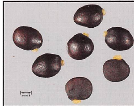
French Broom Seeds