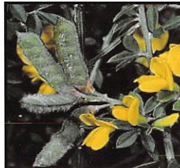
French Broom seed pods

The broom seeds are dispersed several feet from the plant and their hard coats enable them to travel down waterways and in tire and shoe treads. They can germinate after 15 years or more. For example, broom seeds along Highway 32 in Forest Ranch can wash down ravines into Big Chico Creek and germinate 10 years later in a gravel bar in Lindo Channel.